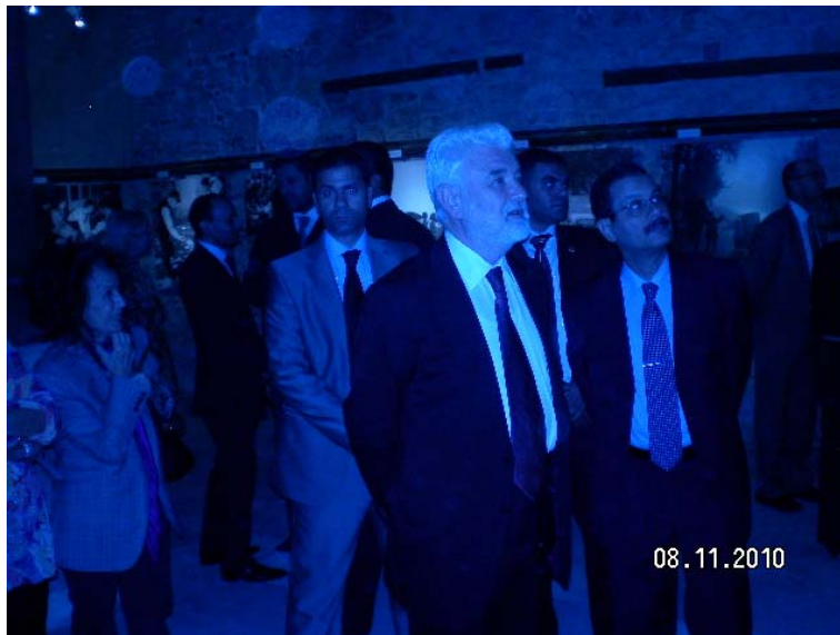
Prime minister Mirko Cvetkovic and Dr. Ahmed darwisj, Minister of State for Administrative Development

An exhibition of Tanjug agency photographs, marking the commencement of the Days of Serbian Culture, was opened in Egypt, in the historical centre of old Cairo, namely in the 14th century Palace of Prince Taz, in the presence of Serbian PM Mirko Cvetkovic.